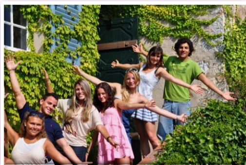
Students at our school "Le Château"