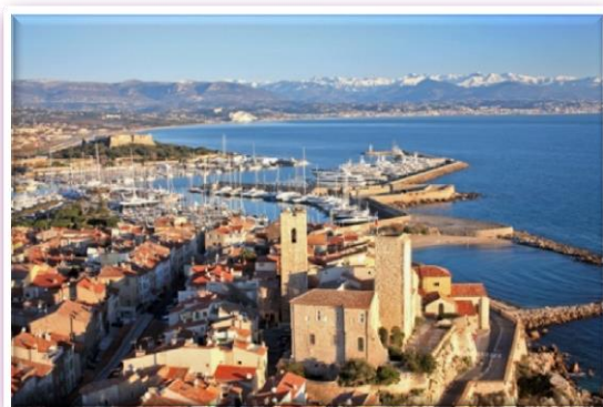
View of Antibes