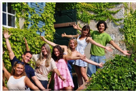
Students at our school "Le Château"